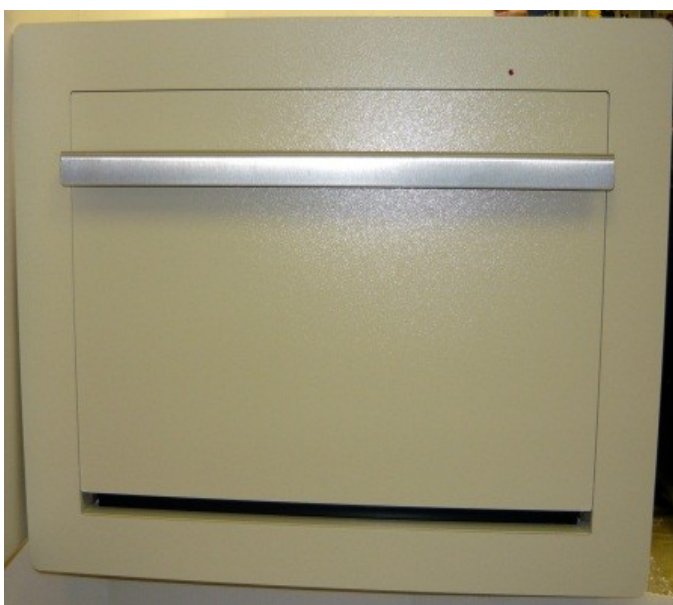
Shown above BTU Outer Door Locked