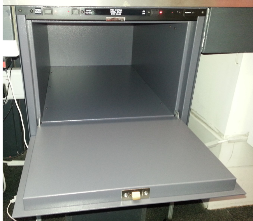
Shown above BTU Inner Door Open

The operating panel can be mounted remotely from the unit, e.g. on a counter or on a wall if desired as an optional extra.